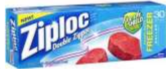
ZIPLOC BAGS: ALL SIZES